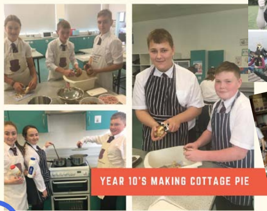
YEAR 10'S MAKING COTTAGE PIE