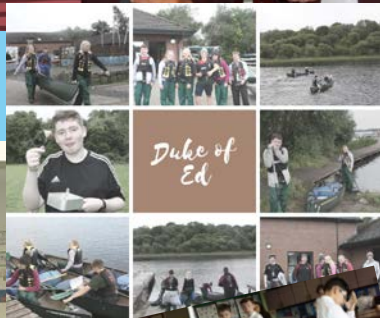
Duke of Ed