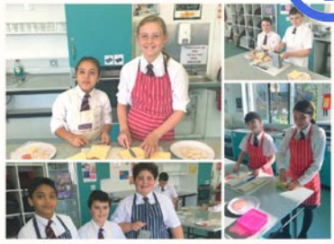
#YEAR 8 TOASTIES