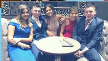
THE SCHOOL FORMAL City of Armagh High School