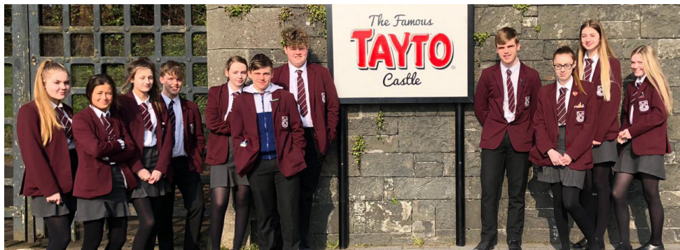
Year 12 Business Studies class visit Tayto, Tandragee as part of their course.