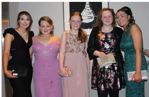
SU Formal at the Hilgrove Hotel.